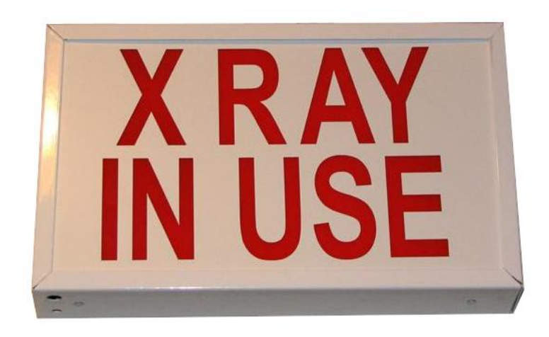
Figure 1 Nova Warning Light Fixture (x-ray in use)

The Nova warning light fixture designed to meet the hospital-grade warning light requirements of medical imaging suites.