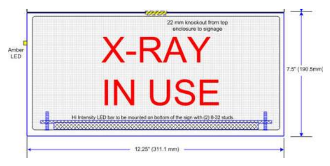
Figure 2 Nova Warning Light Dimensions